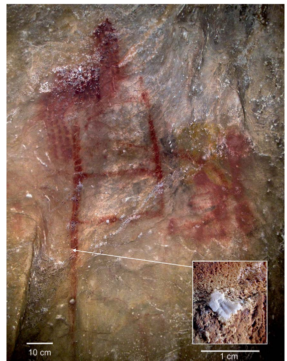
Fig. 1. Red scalariform sign, panel 78 in hall XI of La Pasiega gallery C. This panel features the La Trampa pictorial group (21). (Inset) Crust sampled and analyzed for a minimum age (64.8 ka), which constrains the age of the red line. See (20) for details.

We obtained U-Th ages for 53 samples removed from 25 carbonate formations stratigraphically