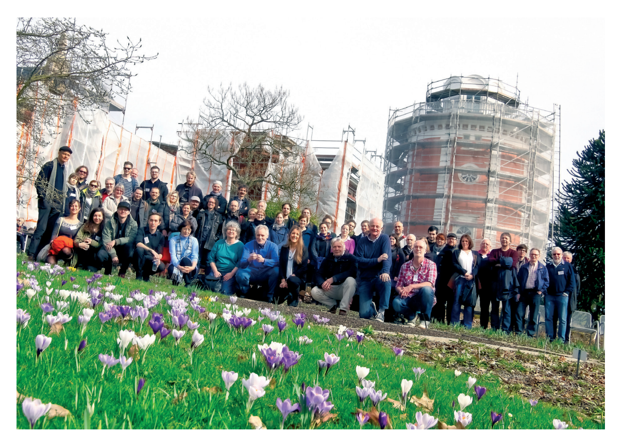
Fig. 1 Group photograph of the attendees of the 26th Mesolithic Conference in front of the venue in the Botanic Garden, Hardt Park, Wuppertal.

The paper at hand is based on the abstracts of the research presented during the Mesolithic conference. The speakers mentioned in the texts are the authors of their respective abstracts. This paper therefore aims to give an insight into the diverse international programme of the conference which will be published in more detail in conference proceedings in the summer of 2018.