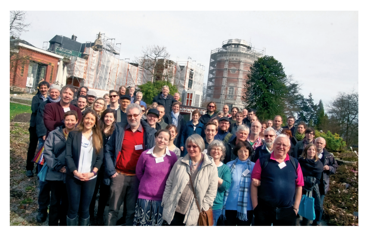
Fig. 7 Another Group photograph of the attendees in front of the venue.